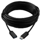
CAB-AOCU-ML USB 3.1 Gen 1 Active Extender Cable