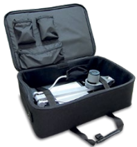
PS-A04 PS Padded Bag For the PS Document Camera