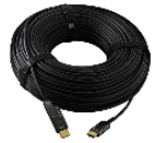
CAB-AOCH-XL HDMI 2.0 Active Extender Cable