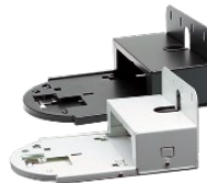
VC-WM12 PTZ Wall Mount