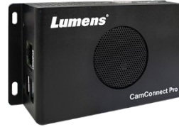
AI-Box1 CamConnect Pro