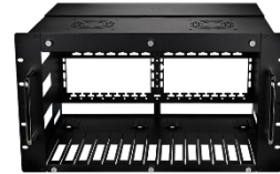
OIP-AC01 6U Rack-mount Chassis For AV over IP series