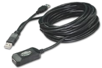
DC-A06 Extender USB Cable USB 2.0 cable extender